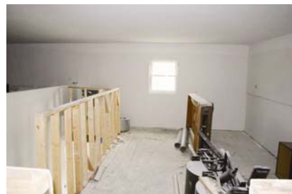
Teen Center-- Entry Area