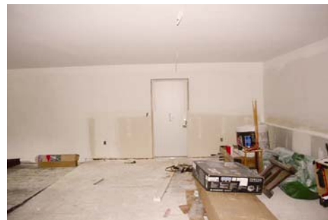
Teen Center-- Gaming Area