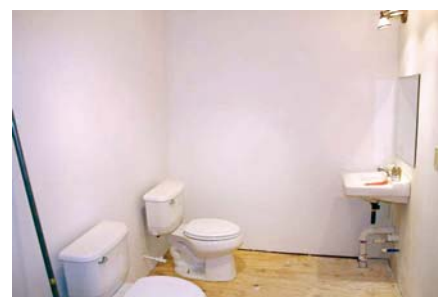
Outreach Center-- bathrooms